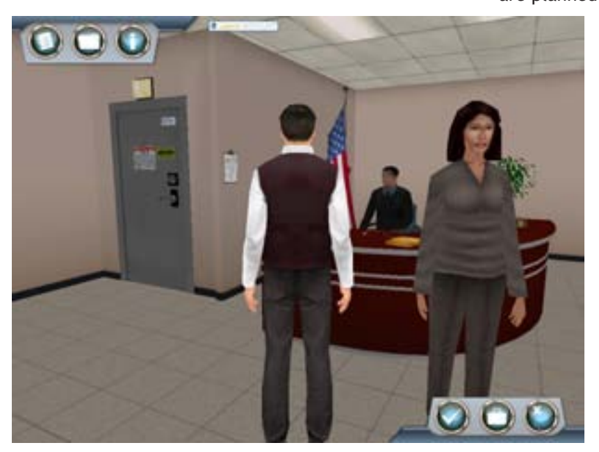
Screenshot of a Virtual Performance Environment

Virtual Environments for Windows Vista and Windows 7 are planned for FY11.