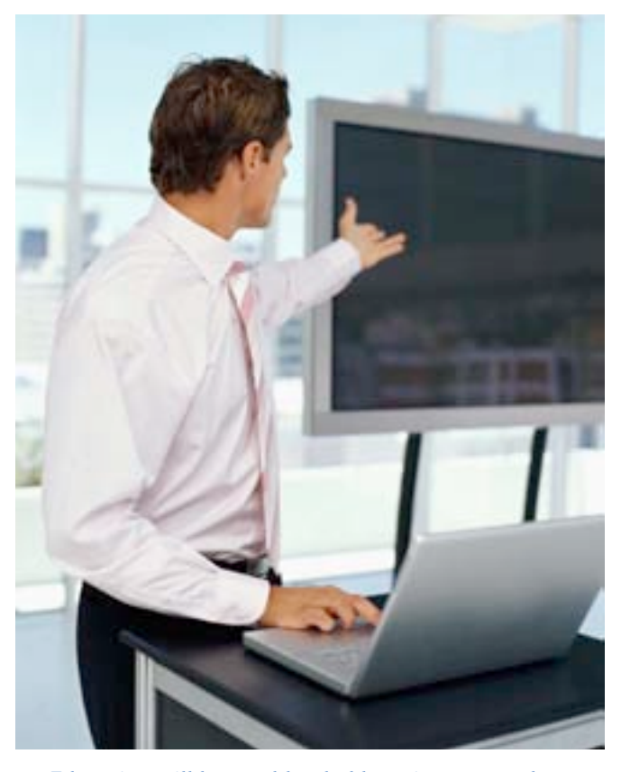
Education will have a blended learning approach to include classroom and distance learning.

In future years, CDSE Education Division will seek accreditation through Middle States Commission on Higher Education (MSCHE). MSCHE accreditation will credential CDSE to confer certificates and degrees that are recognized throughout the security and