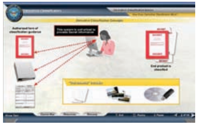
Screenshot from an eLearning course