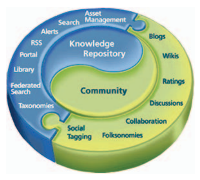
The Knowledge Repository and Community fit together to enable DSS to share ideas and catalog content.

The more extensive a man's knowledge of what has been done, the greater will be his power of knowing what to do. Benjamin Disraeli (1804-1881)