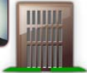
DSS Field Office